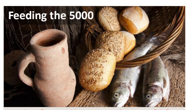
ALL SAINTS ANGLICAN PARISH CBS JULY 28, 2024 – 9<sup>TH</sup> SUNDAY AFTER PENTECOST BAS HOLY EUCHARIST